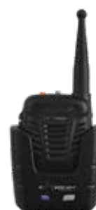
Secondary Wireless Handset (PTT100A)