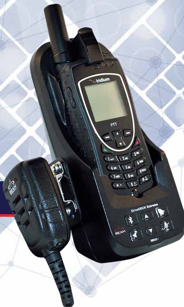
Corded Push-To-Talk Bundle