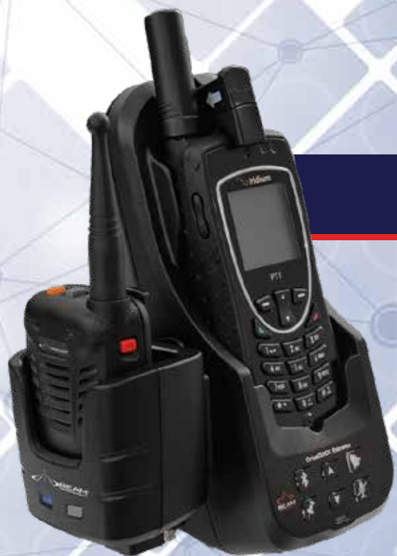
Wireless Push-To-Talk Bundle