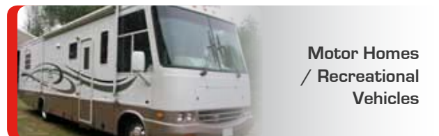
Motor Homes / Recreational Vehicles